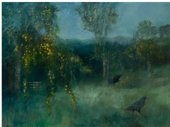
Simon Lewty, I Have Forgotten , 2005, ink and coloured crayon on paper, 56 x 62cm