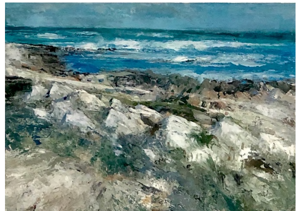
Graeme Williams, Ermelo , 2012, from the Painting Over the Present series, archival digital prints, Image size 41 x 55cm, paper size 47 x 61cm, Edition of 3