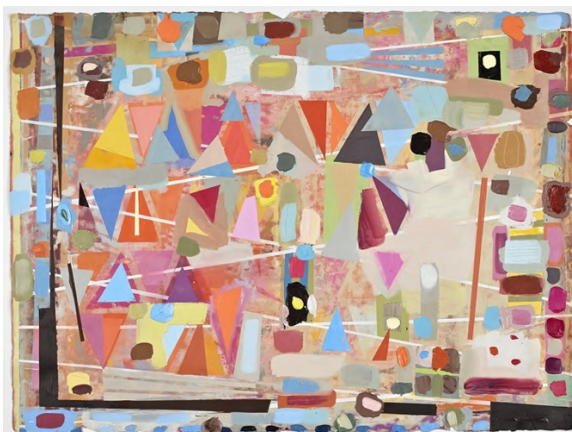
Kevin Laycock, Invention 2 (after Gee's Bend quiltmakers) 2018, oil on paper, 55 x 71cm

By me all things unclean are purified, By me the souls of men washed white again; E'en the unlovely tombs of those who died Without a dirge, I cleanse from every stain.