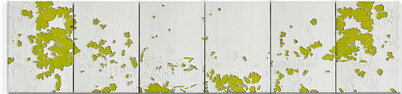
Helen MacAlister The Seat of the Imaginative Faculty , oil on linen sextych, each panel 29.7 x 21 cm

British Art Fair , Saatchi Gallery, 28 September – 2 October 2022