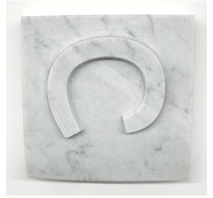
Left to right: Tangents in situ , Red Moon , Granite, D 24cm, Torc , White Carrara marble, 18 x 18 x 5 cm