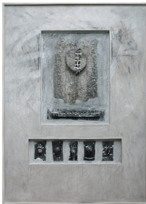
A Short History of North Rona , 2010 lead and mixed media, 154 x 102 x 7cm