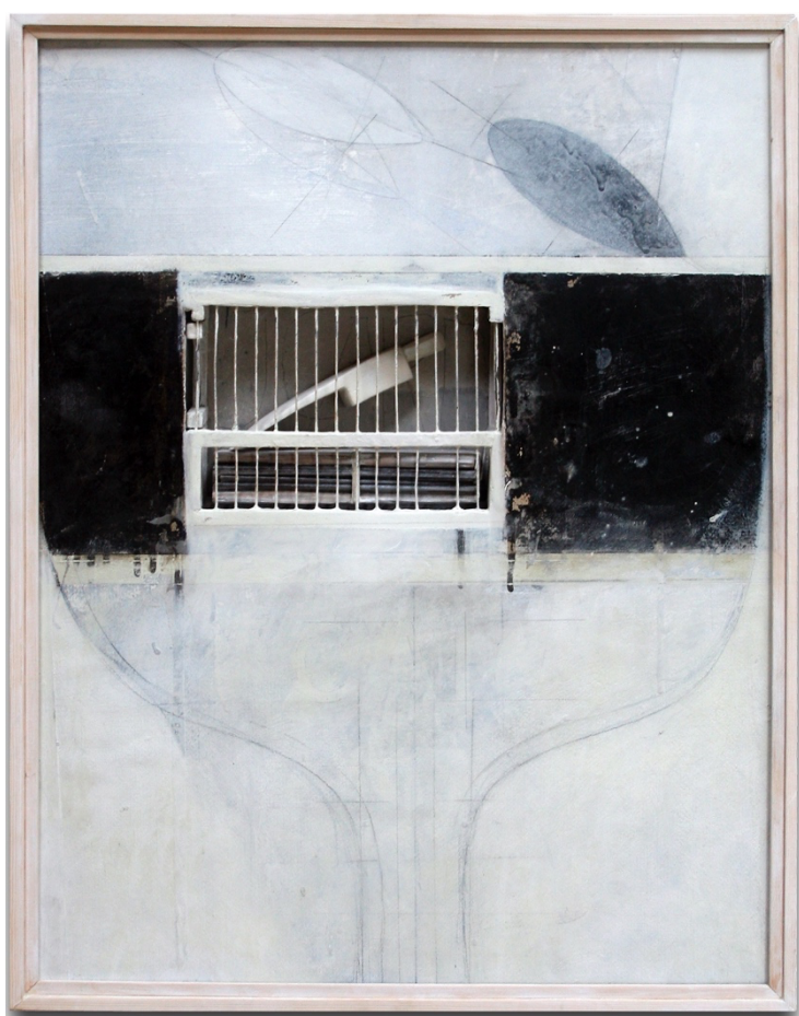
The Voyage of the James Caird to South Georgia, 2012 mixed media and found objects 67 x 52 x 9cm

The two new publications are available from the CAC bookshop, see below.