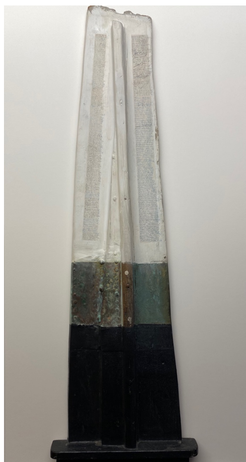
Memory Board, 2012 mixed media and found objects 109 x 24 x 6 cm