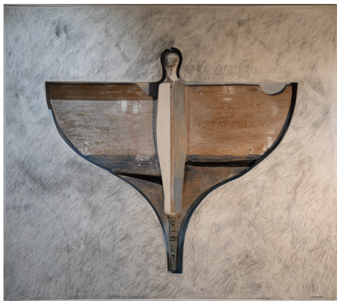
Fhir a Bahta , 2012 mixed media construction, 109 x 123 cm