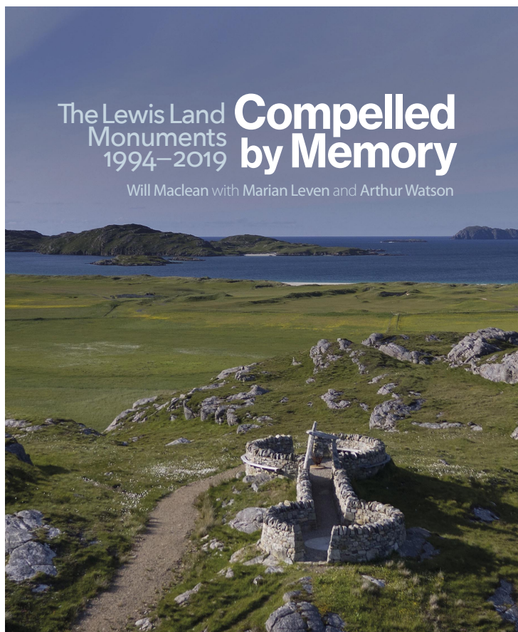
Image (right): Gress , referring to 1915 land raids and the 1918 – 1920 conflict with Lord Leverhulme. Completed in 1996

For any further enquires or to order: contact clare@artfirst.co.uk