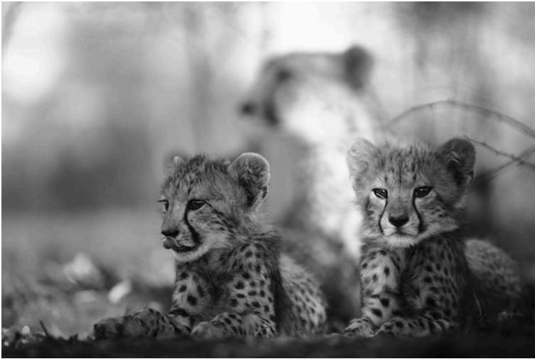
Kim Wolhuter Cheetah Cubs photographic print, 80 x 120cm, edition of 10