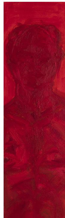
Karel Nel , ObicularPresences , 2015, metallic dust and dry pigment on bonded fibre fabric, 180 x 180 cm Joni Brenner , Heneni Heneni , 2018 (detail) oil on canvas, 95 x 25cm