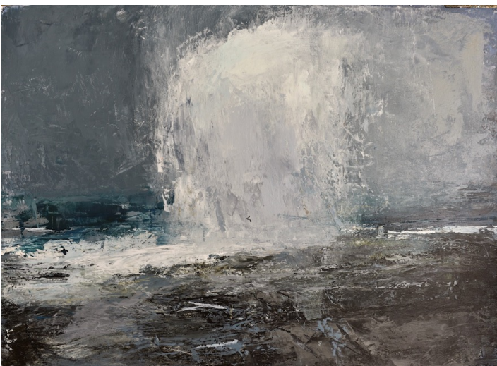
Donald Teskey Riverbank IV , 2018 100 x 120 cm, oil on paper