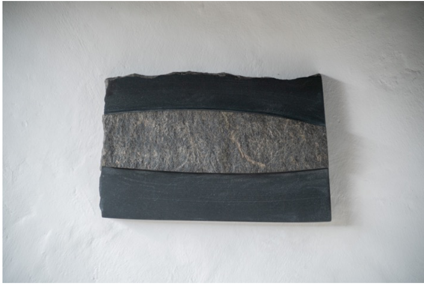
Land IV , 2022, basalt, 19 x 28 x 5cm

Honed for colour and for formal and spatial considerations, the carvings also reveal their initial formation and expose an inherent sense of infinity within their composition. Harvey's simple, silent forms are distilled to an essence that invites contemplation. Principally made by carving, paring down and refining, these sculptures are honed as much by creative impulse as by concept.