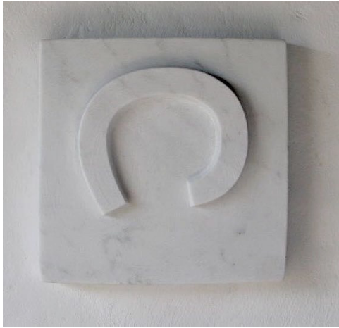
Torc , 2019, Both carved Carrara marble relief, 18 x 18 x 5cm