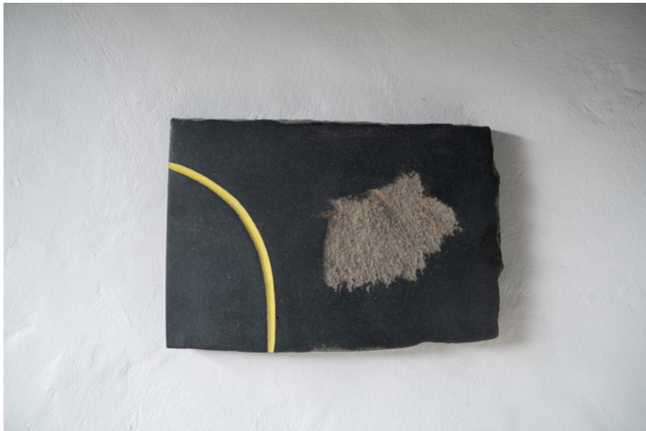
Ware 2022, basalt and yellow enamel, 19 x 26 x 5cm

"Make it as simple as possible, but not simpler" - Albert Einstein