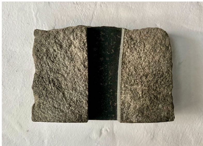
Narrow Gate , 2021m basalt 18 x 24 x 5cm

Through carving the recent basalt works he has come to know that stone not only has the capacity to carry the memory of initial creation, but when worked, reveals evidence of previous makers and functions. These basalts were once street setts, kerbstones and causeway stones. They were quarried then chopped and carved to an approximate usable dimension and each stone carries the drawing, decision-making and mark of those original masons. In use, they were further shaped by the elements and by the traffic of people and animals who traversed over them for a few hundred years. They include that memory too. By creating his own interventions and mark-making Harvey adds another particular trace.