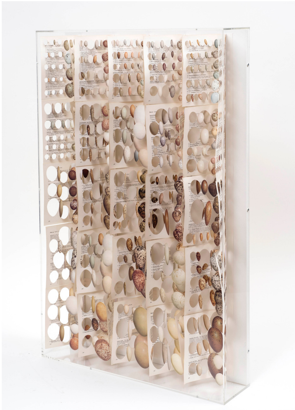
The Collector 2012 Cut book page construction 99 x 61 x 13 cm £13,500

Art First, 15 St. Mary's Walk, London, SE11 4UA E: info@artfirst.co.uk | T: +44 (0)7769 950 884 | VAT No. 256 8356 70 www.artfirst.co.uk