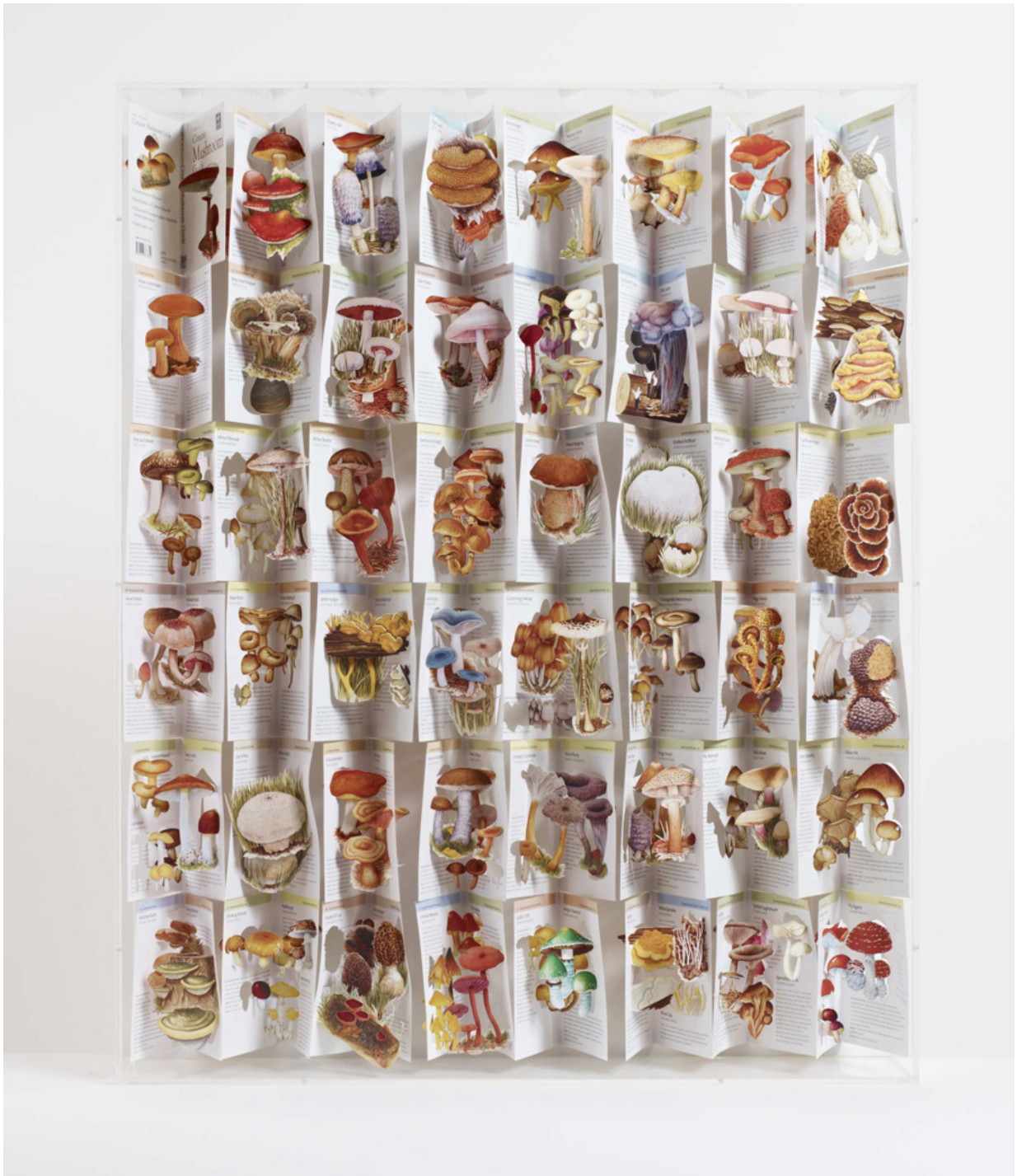
Funghi 2011 Cut book construction 82 x 65 x 11 cm £9,000