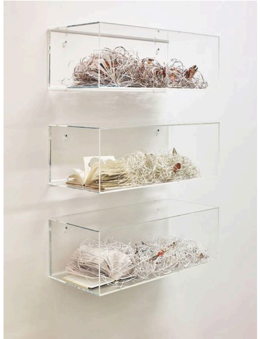
Cloud / Nest / Water, 2014 cut book pages (triptych) 84 x 61 x 27.5cm / 33 x 24 x 11"