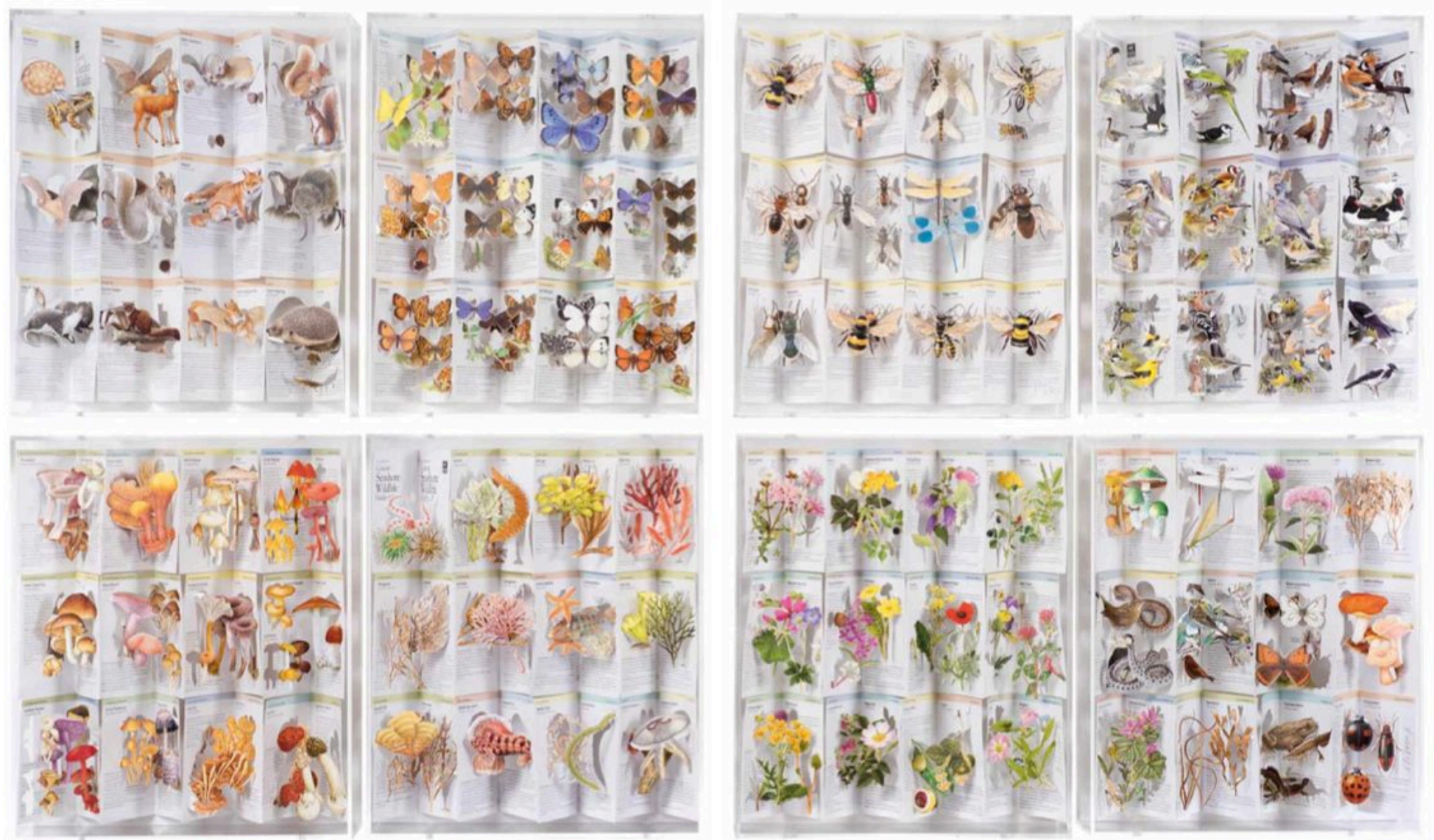
Cabinet of Natural History, 2015 cut and constructed book pages (in 8 cases) 75 x 155 x 10cm / 29.5 x 61 x 4"