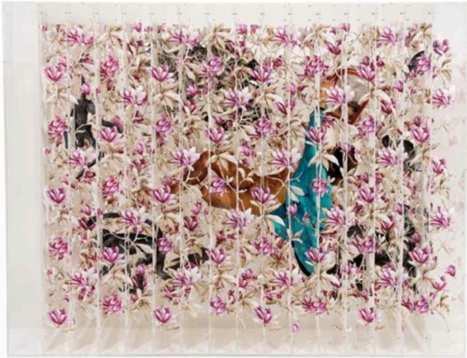
Dream of the Customs Officer II, 2016 cut and constructed print on paper 90 x 115 x 39cm / 35.5 x 45.5 x 15.5"