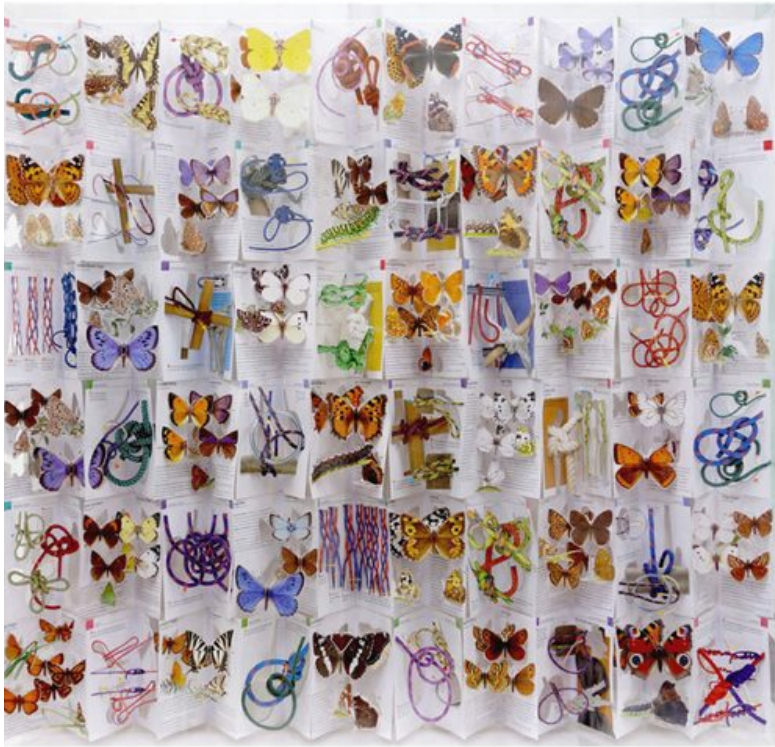
Freedom and Restraint , 2015 cut and constructed book pages 73 x 76 x 10cm / 29 x 30 x 4"