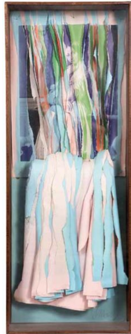
La Comtesse Dechiree , 1978 torn and reconstructed prints on paper 116 x 44.5 x 13cm / 45.5 x 17.5 x 5"