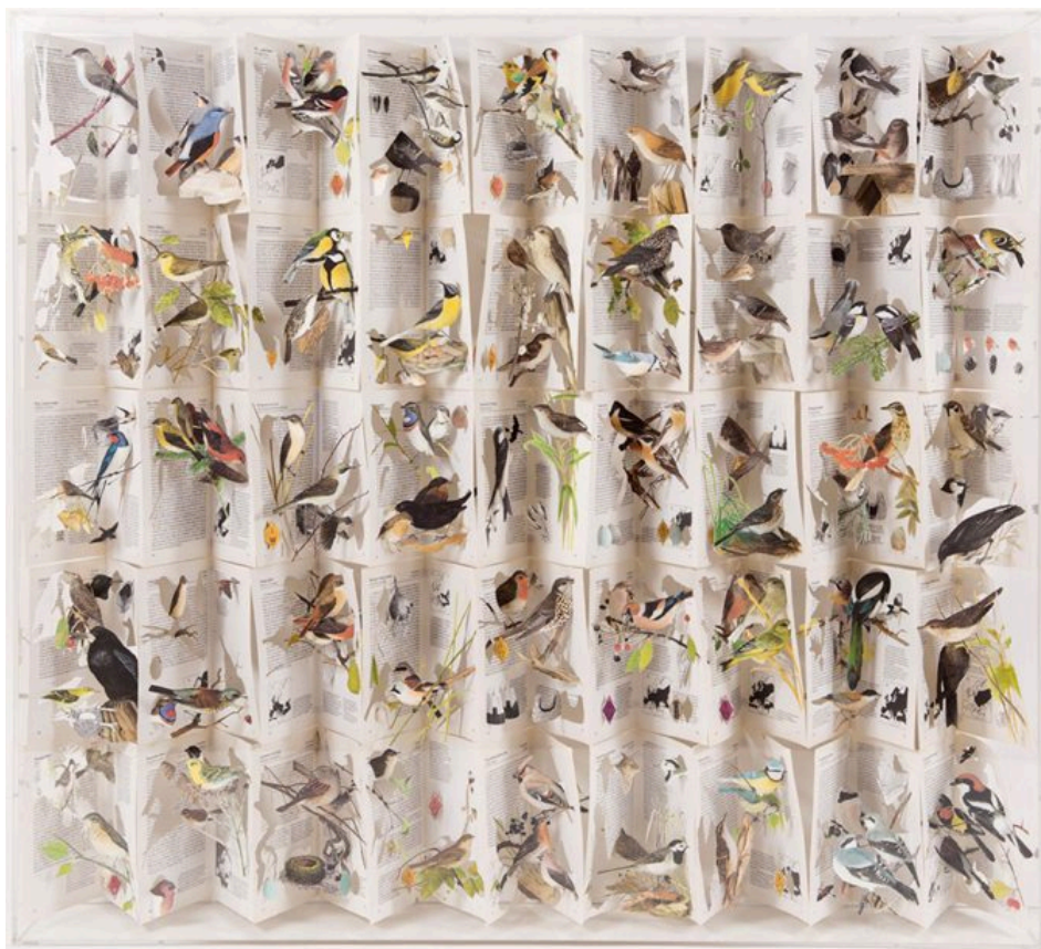
The Librarian's Aviary , 2016 cut and constructed book pages 106 x 116 x 16cm / 42 x 45.5 x 6.5"