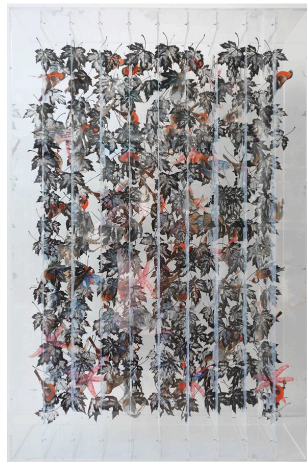
Falling and Swimming , 2016 cut and constructed print on film 109 x 71 x 27cm / 43 x 28 x 10.5"