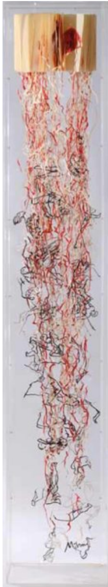
The Damned Being Cast into Hell, 1998 cut book pages 250 x 42 x 22cm / 98.5 x 16.5 x 8.5"