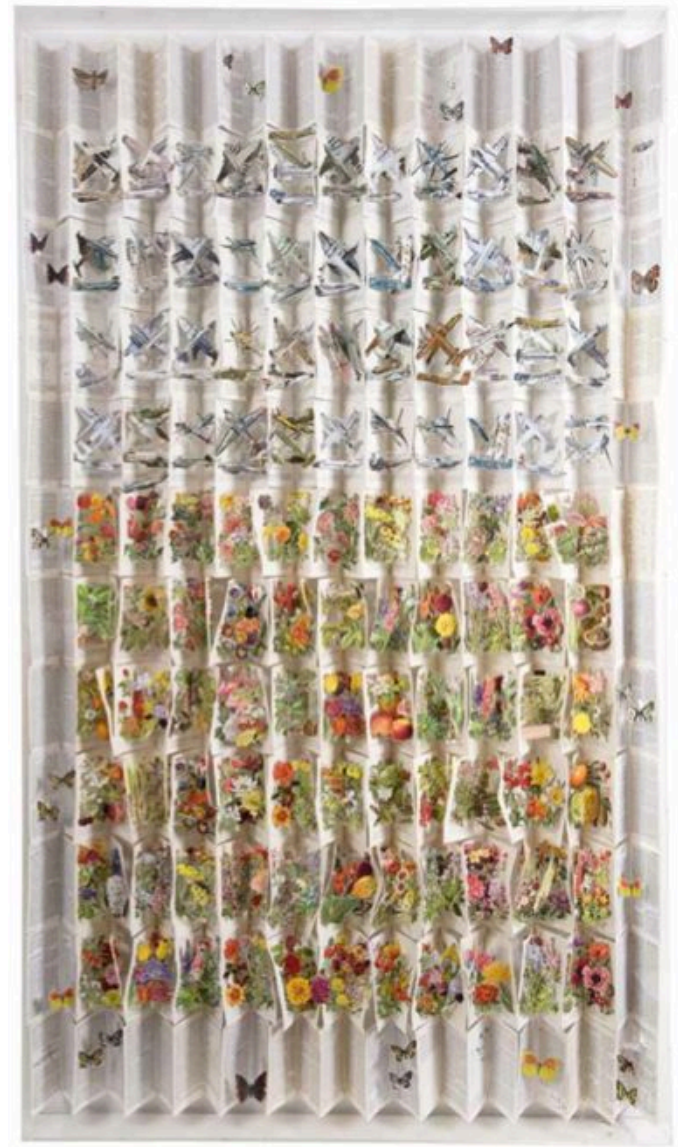
Grey Skies , 2015 cut and constructed book pages 215 x 121 x 14cm / 84.5 x 47.5 x 5.5"