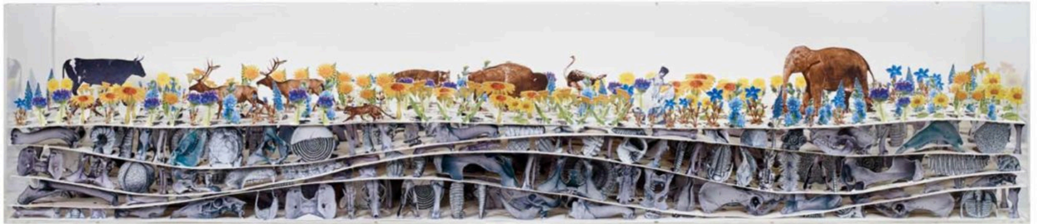
Dance in Time , 2004 cut and constructed print on paper 27 x 125 x 25.5cm / 10.5 x 49.25 x 10"