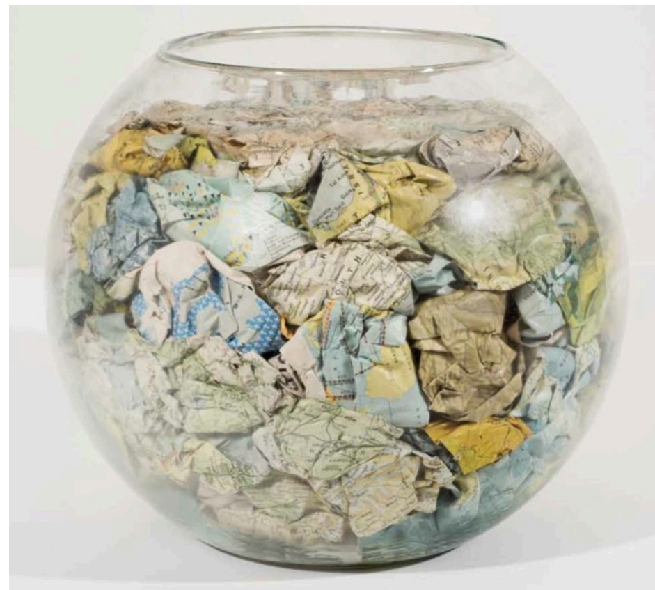
Goldfish Bowl , 1982 crumpled map pages, goldfish bowl 25 x 32 x 32cm / 10 x 12.5 x 12.5"