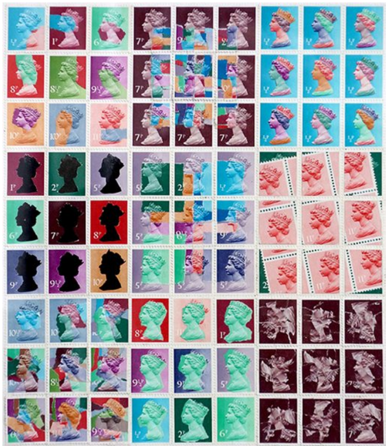
Medley , 1979 torn and reconstructed stamps 25 x 22cm / 10 x 8.5"