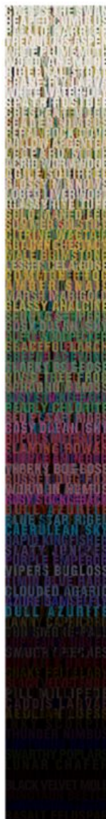
Into the Dark Wood IV , 2008 archival inkjet print, edition of 9 197 x 38cm / 77.5 x 15"