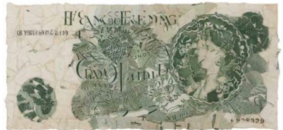
The Inept Forger , 1973 (shown with surround & detail) torn and reconstructed banknote 6.7 x 13.5cm / 2.5 x 5.5"