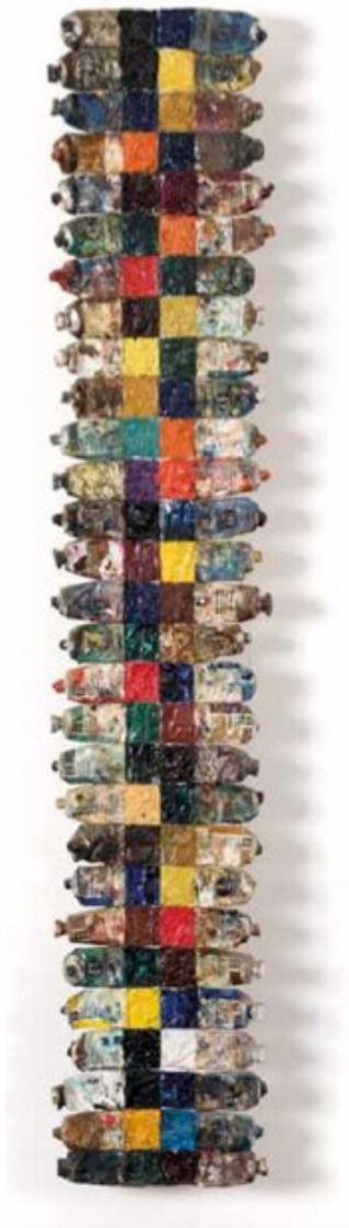
Strip , 1996 cut spent paint tubes 110 x 21cm / 43.5 x 8.25"