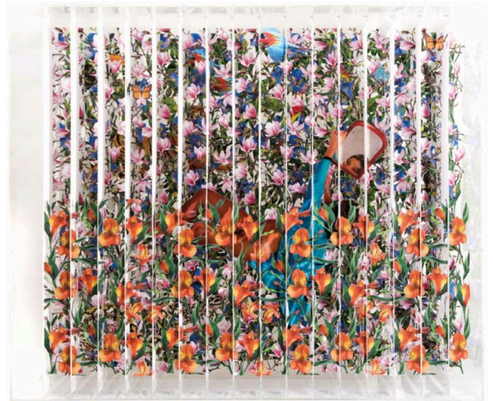
Dream of the Customs Officer III, 2016 cut and constructed print on paper 117 x 140 x 41.5cm / 46 x 55 x 16.5"