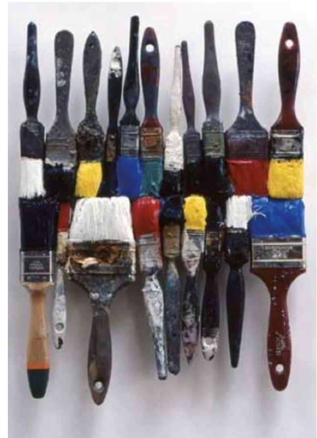
Still Life and Abstract Painting , 1996 acrylic on paint brushes 45 x 32cm / 17.75 x 12.5"