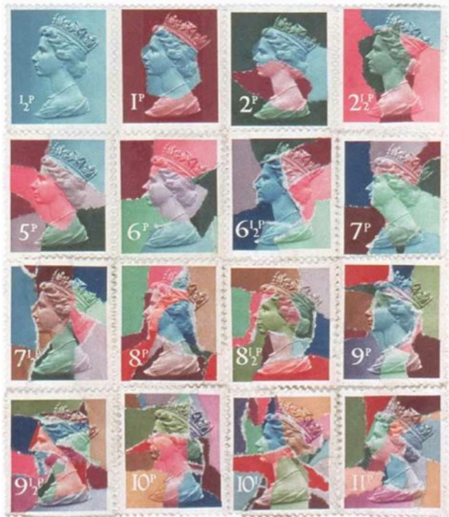
Contagion , 1975 torn and reconstructed stamps 9.6 x 8cm / 4 x 3"