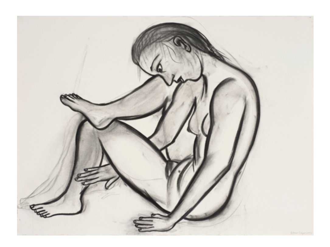
Top: Reach, charcoal on paper, 56x76cm