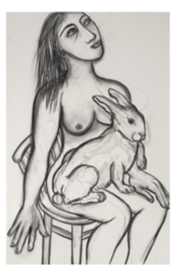
Clockwise from top left: Woman in Chair with Gloves / Woman with Plant Woman with Cats / Woman with Rabbit All: Charcoal on paper, 102x67cm