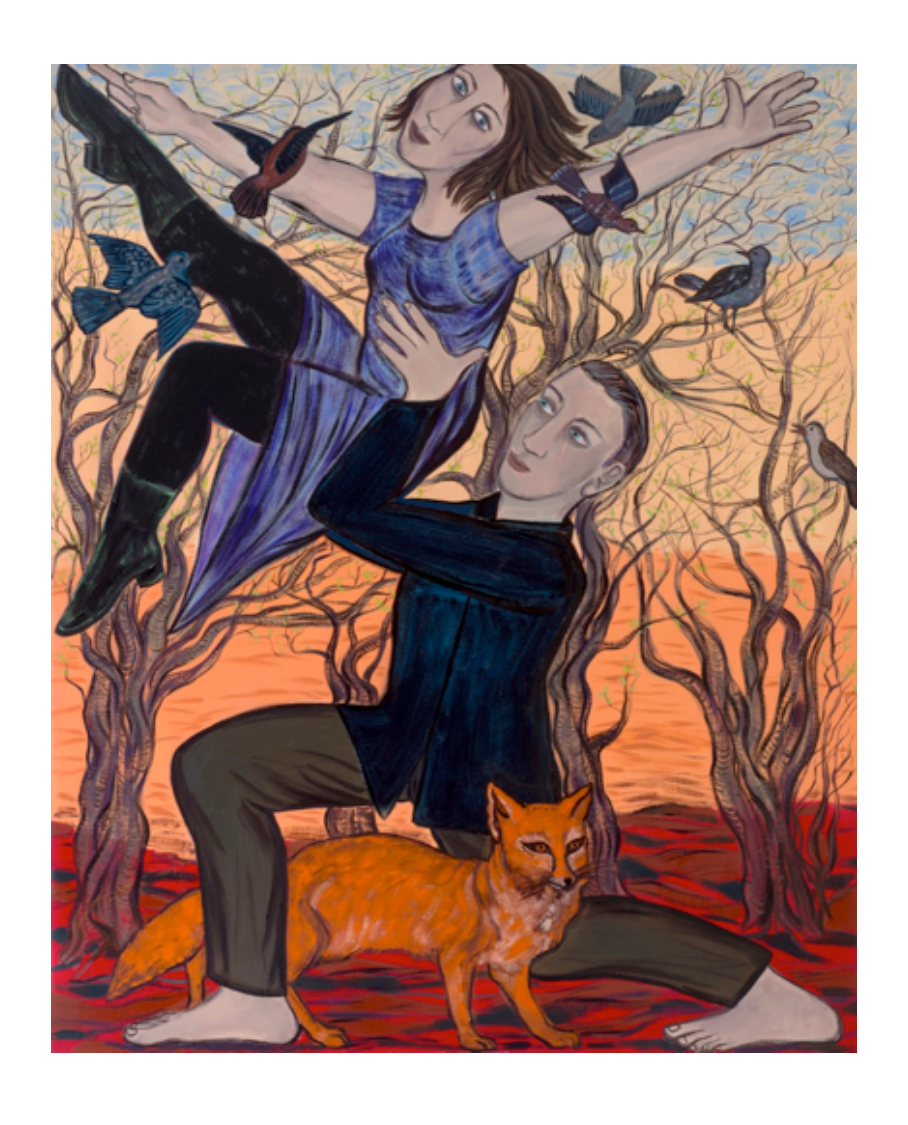
Spring Fever Oil on canvas, 168x137cm