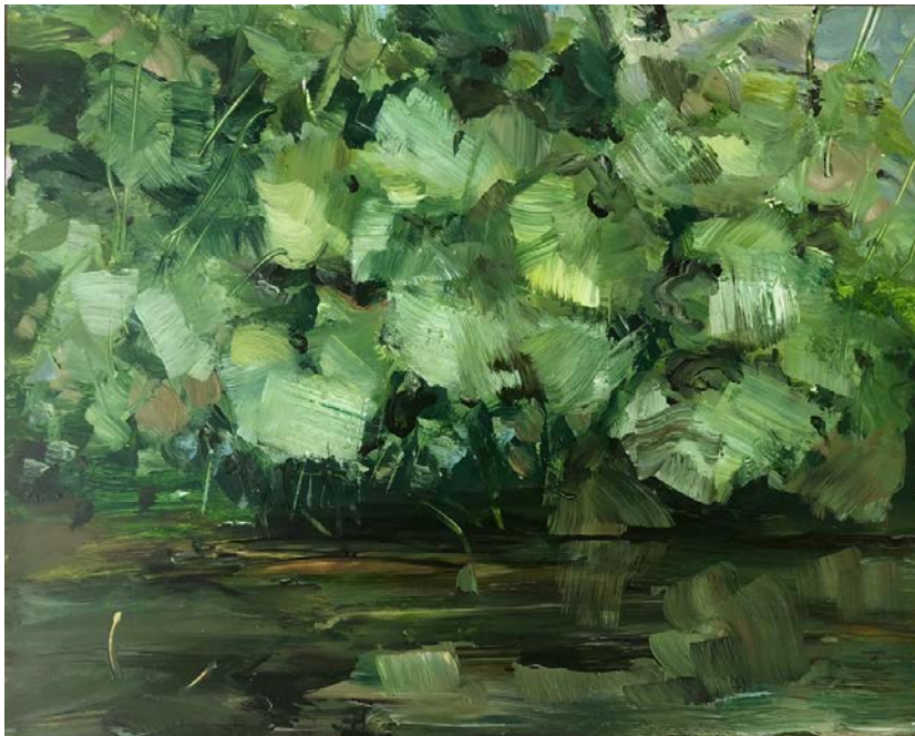
River series I , 2018 Oil on panel, 24 x 30cm, £6,250