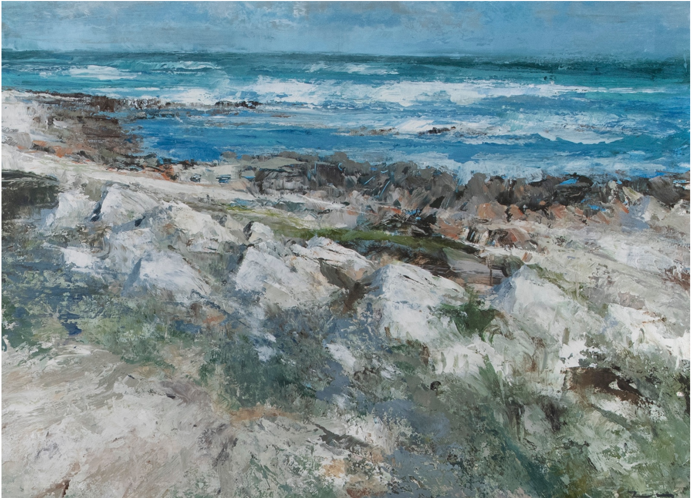
Cape Agulhas II (South Africa), 2019 Acrylic on paper, 76 x 105cm, £17,500

Art First, 15 St. Mary's Walk, London, SE11 4UA