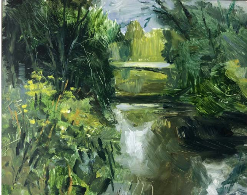
River series IV , 2018 Oil on panel, 24 x 30cm, £6,250