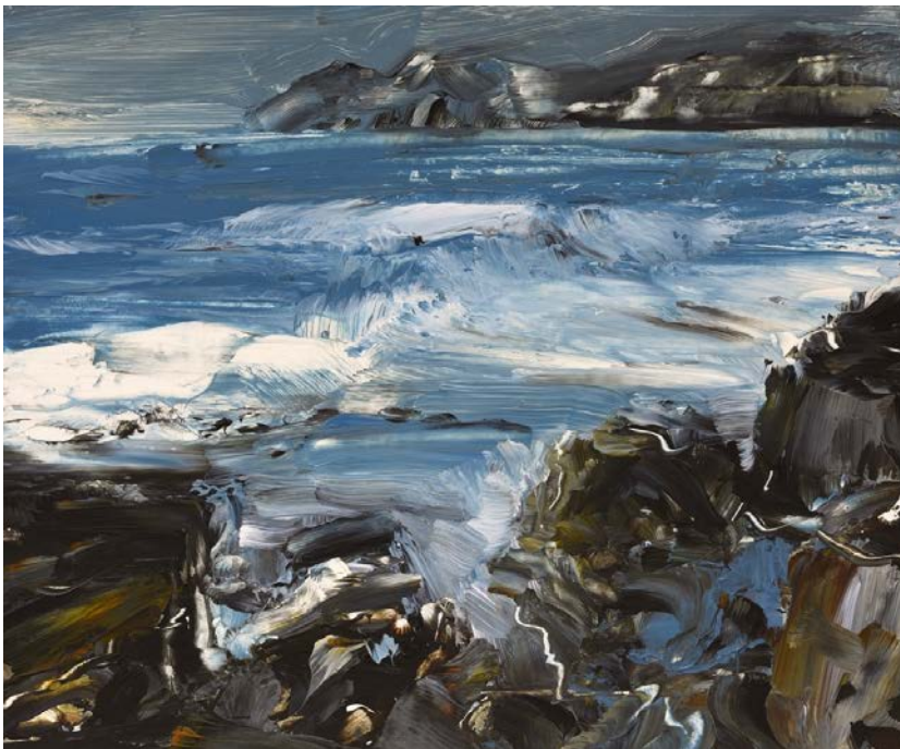
Cape V (VDG), 2019 Acrylic on paper, 19 x 23.7cm, £4,000