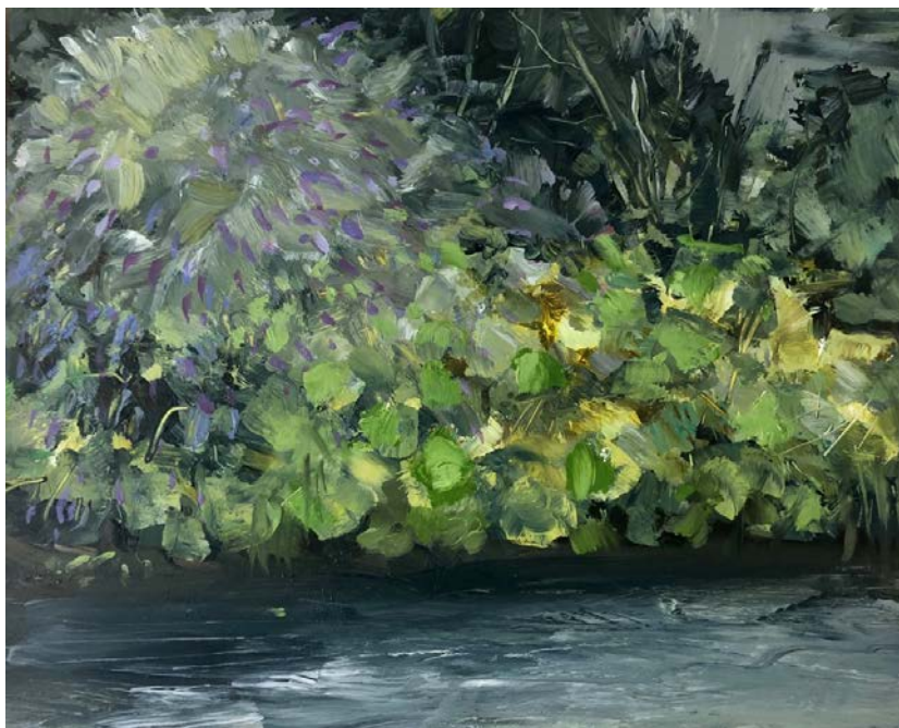
River series III , 2018 Oil on panel, 24 x 30cm, £6,250

Art First, 15 St. Mary's Walk, London, SE11 4UA