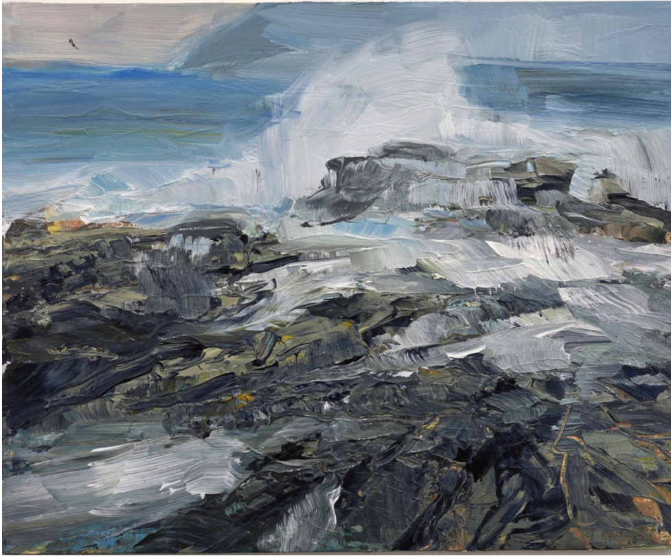
False Bay I , 2019 Acrylic on paper, 20.5 x 25.5cm, £4,250

Art First, 15 St. Mary's Walk, London, SE11 4UA E: clare@artfirst.co.uk | T: +44 (0) 7711 945098 | I: @artfirstlondon www.artfirst.co.uk