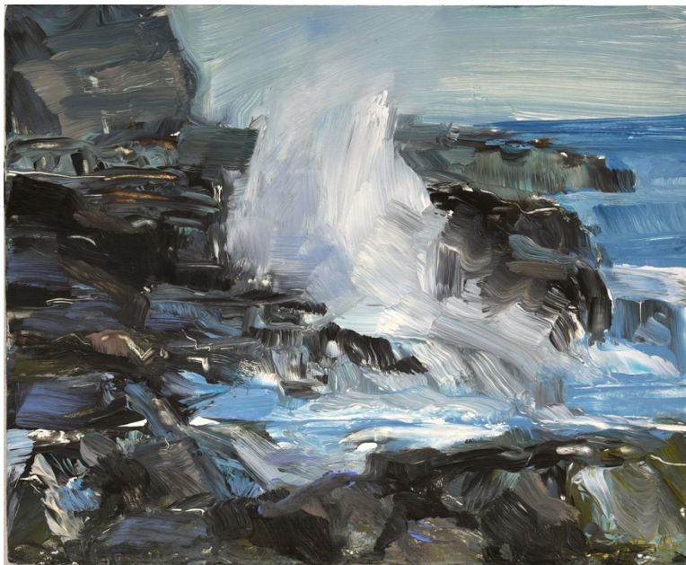
Cape Study VI, Cape of Good Hope, 2019 Acrylic on paper, 19 x 23.7cm, £4,000