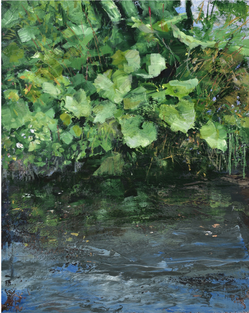
Water level II , 2018 Oil on canvas, 76 x 61cm, £15,800

Art First, 15 St. Mary's Walk, London, SE11 4UA E: clare@artfirst.co.uk | T: +44 (0) 7711 945098 | I: @artfirstlondon www.artfirst.co.uk