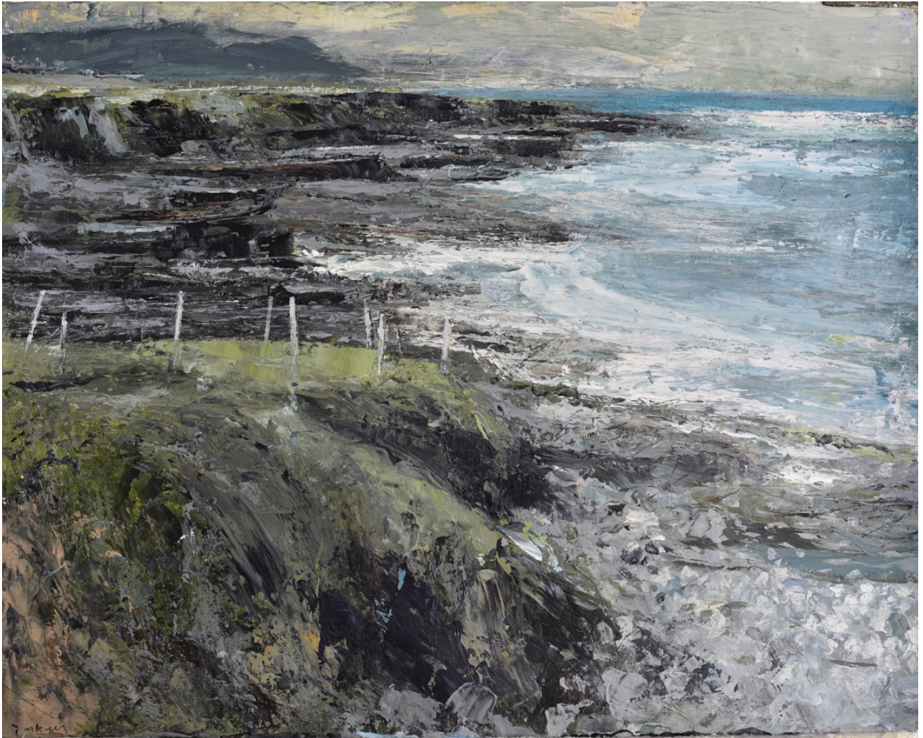
Coastal Report VII, Portnahally co Mayo, 2016 Acrylic on paper, 77 x 90cm, £15,500

Art First, 15 St. Mary's Walk, London, SE11 4UA